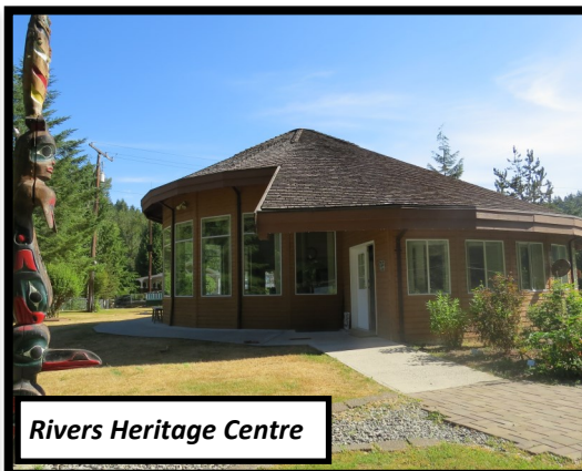
Rivers Heritage Centre