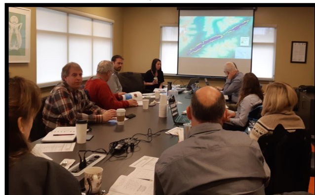
Fish Passage Feasibility Project Committee Meeting

Alouette River Management Society gratefully acknowledges the financial support of the Fish and Wildlife Compensation Program for its contribution to the Alouette Watershed Sockeye-Fish Passage Feasibility-Year 5 and Year 6. www.fwcp.ca