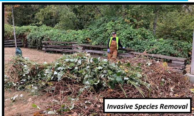
Invasive Species Removal

Making a positive impact on people, animal welfare and the environment