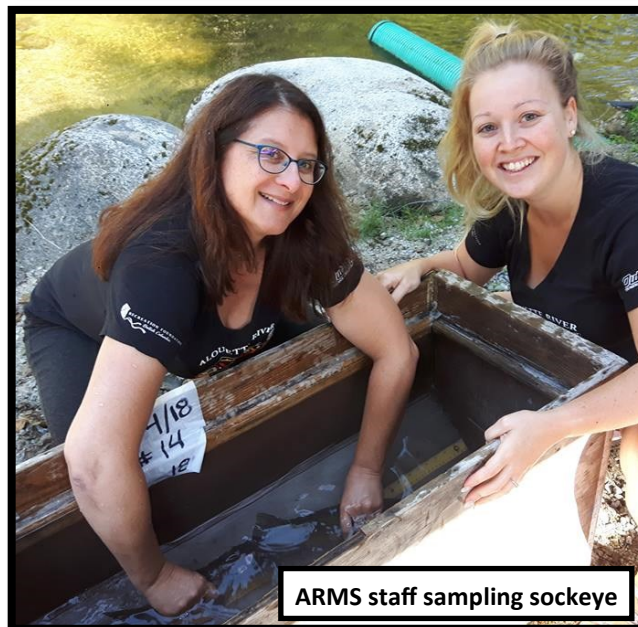
ARMS staff sampling sockeye