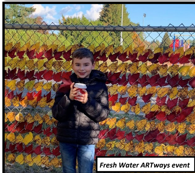
Fresh Water ARTways event