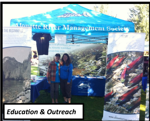
Education & Outreach